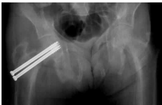
Figure 2. Radiograph of the right hip showing complete fracture of the femoral neck with multiple hip screws in place.

Calcitriol was initiated in addition to the patient's treatment regimen. Cinacalcet, a calcimimetic, was also prescribed but was not taken because it was both expensive and not available. On follow up, her intact PTH decreased and calcium level normalized, but hyperphosphatemia and vitamin D deficiency persisted (Table 1). Bone densitometry demonstrated bone mineral