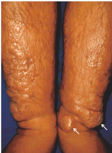
Figure 4. Skin-colored to yellowish, waxy indurated papules; verrucous nodules and plaques (arrow) with the characteristic peau d orange appearance of both lower extremities demonstrating Graves dermopathy.

Graves' disease is an autoimmune disorder of the thyroid gland with characteristic peripheral manifestations. The most common extrathyroidal manifestation is ophthalmopathy, present in 50% of patients 1-2 ; followed by dermopathy in 4-5% 3-5 ; and acropachy in 1%. 6 The triad of dermopathy, acropachy and exophthalmos occurs very rarely, as it is seen in less than 1% of patients with Graves' disease. 7 The treatment of Graves' ophthalmopathy is aimed to alleviate symptoms, and prevent disease progression and serious ocular sequelae. Treatment options include systemic glucocorticoid therapy, orbital radiotherapy and orbital surgical decompression. 8-9 The goal of treatment of Graves' dermopathy is to decrease hyaluronic acid production by the fibroblast. This includes