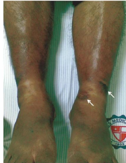
Figure 5. Resolution of dermopathy after intra-lesional steroid treatment and decompression physiotherapy.

intralesional steroid injection; topical steroid with occlusive dressings and compression; systemic steroids; surgical excision; and immunotherapy. 2-3,10 Graves' acropachy generally does not require treatment. 2