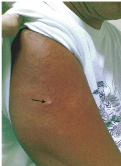
Figure 3. Graves dermopathy showing flesh colored nodules on the upper arm (arrow).