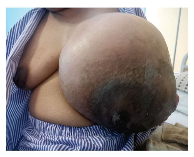
Figure 1. Physical findings showed a giant left breast mass measuring 20 cm × 20 cm in diameter with ulceration of the overlying skin.

Initial laboratory data showed severe hypoglycemia (random blood glucose 1.7 mmol/L) and hypokalemia (serum potassium 2.8 mmol/L). Otherwise, her full blood count, venous blood gas, and function tests of the kidney, liver and thyroid were normal. Random serum cortisol taken before initiation of hydrocortisone was inappropriately low (166 nmol/L) when her random blood