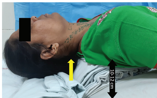
Figure 1. Positioning the patient for Modified Rose's Method. The yellow arrow shows the hyperextended neck, and the black double arrow shows the necessary elevation of shoulder blades should be 10-12 cm. This can be achieved by a shoulder roll or a pillow.

Patient was asked to lie down. A pillow was placed below the shoulder blade with 10-12 cm elevation while extending the head and neck. A head support is placed behind the occiput of the patient (Figure 1). Patient's discomforts should be assessed at this stage for breathing difficulty, pain over the neck. Begin the examination as follows (Figure 2A-2H):