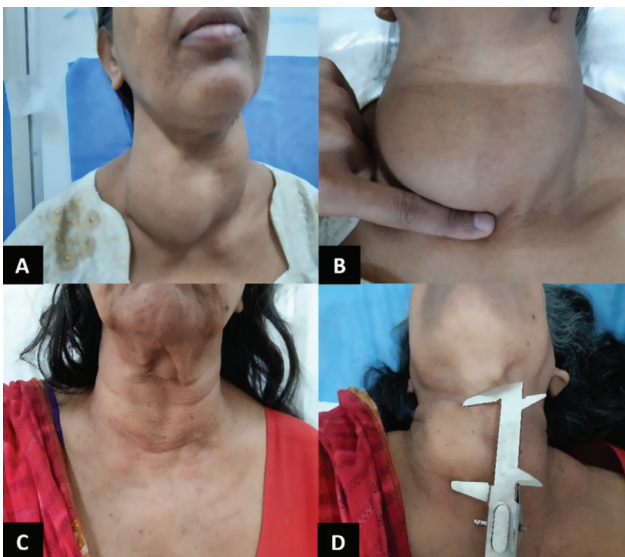
Figure 3. Examination by Modified Rose method. (A) A multinodular goitre seen on standing position; (B) examined in the modified rose position with palpation of the lower border; (C) faintly visible swelling on standing position; (D) the same swelling became prominent when examined in this position.

from the Department of Surgical Disciplines. Investigators recorded the finding without conferring with each other. The resident was trained by the Professor of Surgery in performing the various physical examination methods till Cohen's kappa statistics attained a value of '0.9.' This junior resident started the recordings of finding only after his training. The thyroid swellings were examined using four methods: Lahey's, Crile's, Prizzilo's and modified Rose (Appendix 1) in this sequence and the findings noted (Appendix 2). The duration of examination was somewhere between 10-15 minutes. Ultrasound (USG) of neck was performed in all the patients and considered