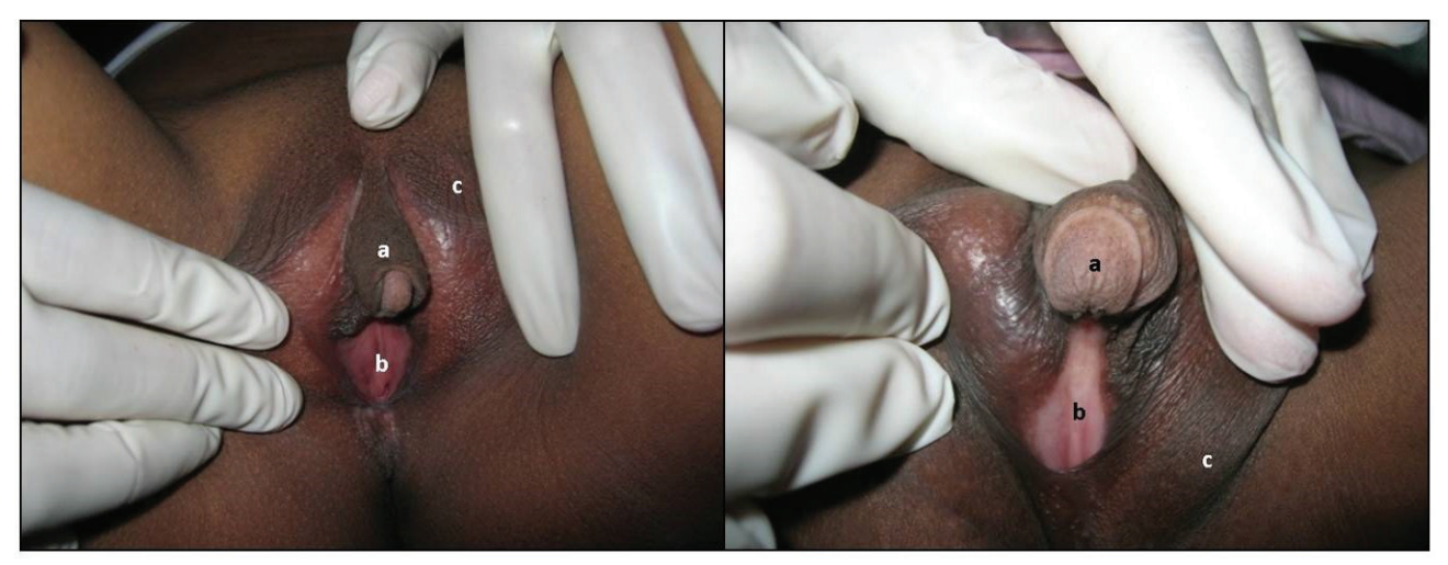
Figure 3. Virilized external genitalia in 2 female siblings showing clitoromegaly (a), presence of vaginal introitus (b), and hyperpigmentation (c).