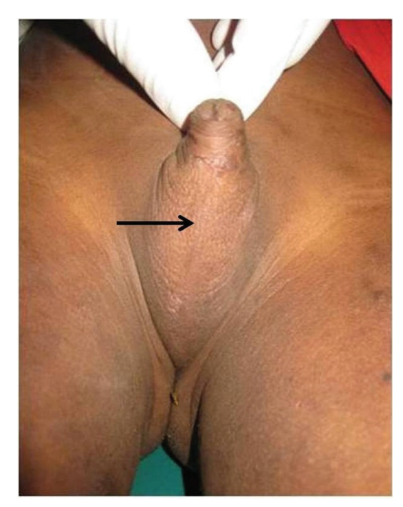
Figure 4. An 8.5-year-old child assigned to male gender with 46,XX late-identified CAH. There is complete labial fusion ( arrow ) resembling a scrotum.

found a good correlation between age and phallus length in late-identified CAH (r=0.466, p<0.05) (Figure 1). More than 50% of both SW type and SV type CAH had labial scrotalization. Complete labial fusion was more frequent in SW (20%) compared to SV (17.9%) (p>0.05).