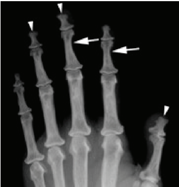
Figure 1. AP radiograph of the left hand, cropped to accentuate osseous detail. Areas of subperiosteal resorption are seen markedly at the radial aspect of the third middle phalanx, and subtly at the radial aspect of the second middle phalanx ( arrows ). Acro-osteolysis is also evident at the distal phalanges ( arrowheads ).

At the time when the patient was diagnosed with PHPT, sodium dihydrogen phosphate was the medical treatment for persistent hypercalcemia. Subsequently, cinacalcet was added when it became available. Unfortunately, she experienced adverse adverse effects from cinacalcet: persistence of poor appetite, nausea and vomiting led discontinuation of the drug for one month. When cinacalcet was reinitiated, the dose was titrated upward gradually to the optimal dosage of 25 mg twice daily without severe adverse gastrointestinal effects. Ergocalciferol (vitamin D2), at a dosage of 0.25 \mu g daily (titrated based on the calcium level) was also started for her subnormal serum 25(OH)D level.