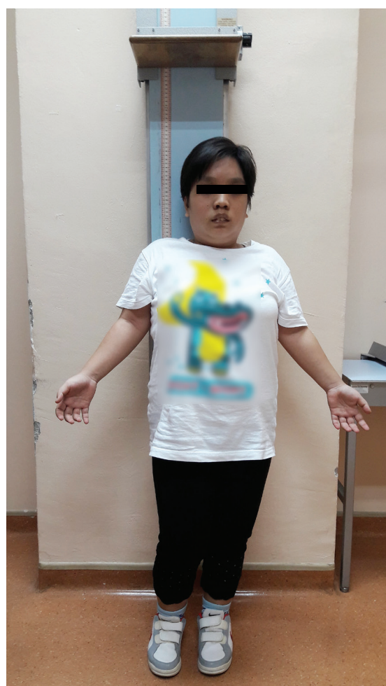
Figure 3. 24-year-old girl with 45,X/46,X,r(X) karyotype untreated with growth hormone showing cubitus valgus and short stature with a final height 19 cm below the mid-parental height which is indicated by the level of the Harpenden stadiometer head-block.

Two patients in Group B had unusual presentation. One of them had presented with spinal bifida, Arnold Chiari malformation and communicating hydrocephalus at birth. Clinical features of Turner syndrome were also present, i.e., oedema of hands and feet, nail dysplasia, low set ears and scoliosis. G-banded chromosome karyotyping