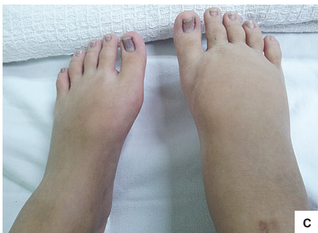
Figure 1. (A) Low set ears, micrognathia and short webbed neck in a 12-year-old with 45,X karyotype. (B) Short 4th and 5th metatarsals and hypoplastic nails in a 16-year-old girl with 45,X karyotype. (C) Right foot lymphoedema, bilateral hyperconvex and hypoplastic nails in a 11-year-old girl with 45,X karyotype.