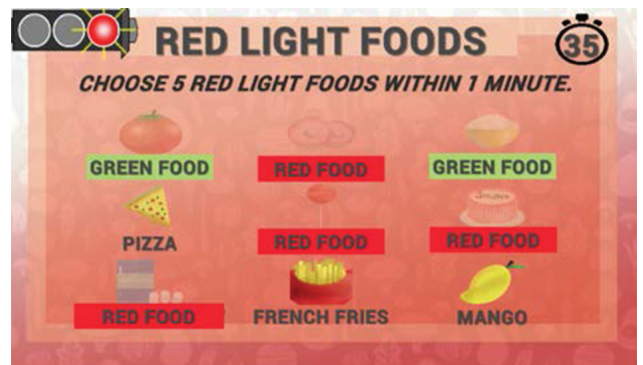
Figure 4. Gameplay of Red Light Foods. After clicking the food, the correct food group classification is displayed.