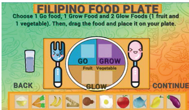
Figure 3. Gameplay of the Filipino Food Plate.