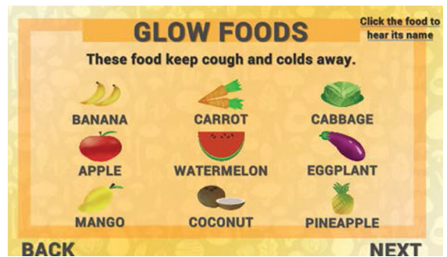
Figure 2. Examples of Glow Foods.