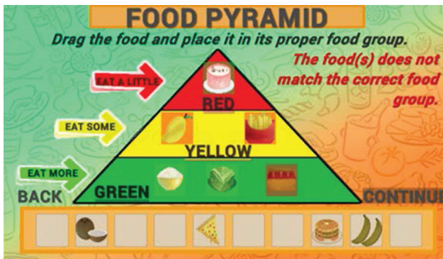
Figure 5. Gameplay of Food Pyramid. The boxes of food highlighted in green are correct while those in red are incorrect answers.