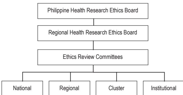
Figure 2. Structural organization of ethics review in the Philippines

Structurally, ethics review in the Philippines is decentralized (Figure 2). Ethics review is supervised by the PHREB and its regional arms, the Regional Health Research Ethics Boards. Aside from institutional ethics review committees, regional ethics review committees and cluster review committees conduct ethics review for researches in institutions without their own ethics review systems. 16