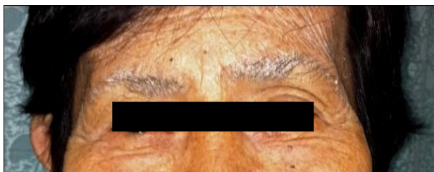
Figure 4. Four weeks after discharge, there was a significant improvement in her facial puffiness. Note the loss of the lateral third of the eyebrows, called Queen Anne's sign.

Four weeks after hospital discharge, the patient was able to ambulate with minimal assistance (Figure 4). Her bowel movement frequency improved to 2 to 3 times per week. TSH level decreased to 74.24 mU/L, while free T4 was 8.62 pmol/L. Repeat echocardiogram showed no evidence of diastolic collapse and resolution of pericardial effusion. Lipid profile and TSH level normalized after twelve weeks (Table 1).